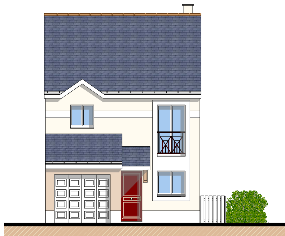
FACADE NORD EST