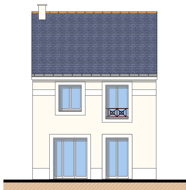
FACADE SUD OUEST